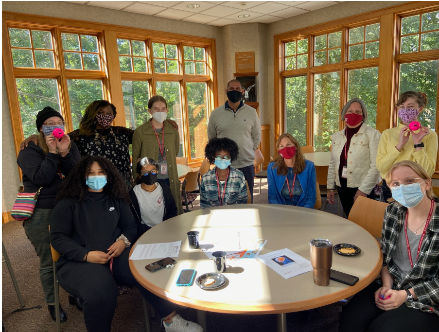
Psychology students joined faculty at the beginning of the semester to connect and celebrate the return to campus!